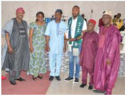
The Provost with one of the awardee and members of the executive of CYIAP network.