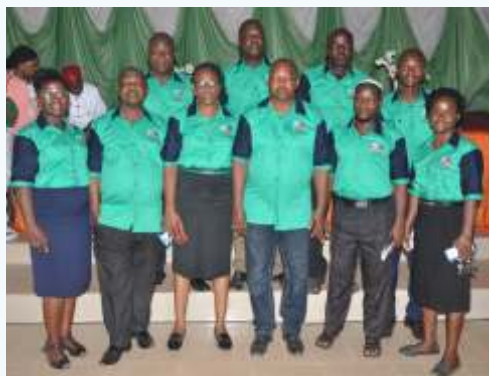
Staff of Adeyemi College of Education Agricultural Science Department.