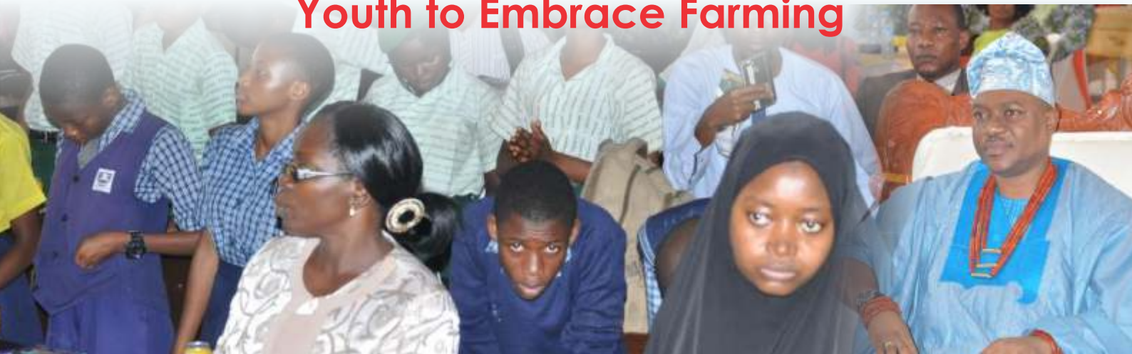
Participants at the 15th CYIAP conference in Nigeria held in the College before the COVID-19 lockdown

The Olowo of Owo kingdom, His Royal Majesty, Oba Ajibade Gbadegesin Ogunoye, has stressed the need for the government at all levels in Nigeria to go back to agriculture in their quest at increasing foreign exchange earnings.