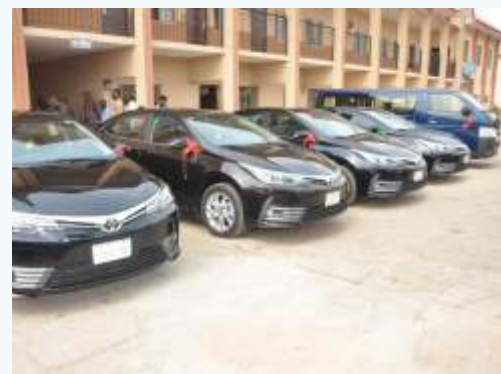
The newly commissioned Toyota Corolla cars and Toyota Hiace bus