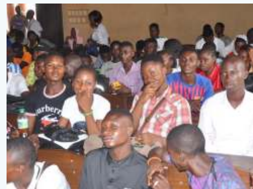
Participants at the Conference