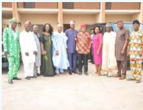
Council Members with the Chairman after the Commissioning Exercise