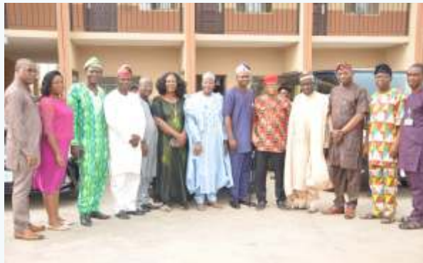
Council Members and Principal Officers of the College