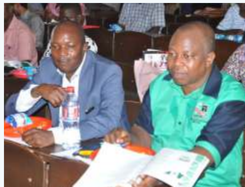
Staff of the Department of Agricultural Science, Adeyemi College of Education