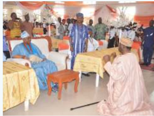
One of the traditional chiefs paying obeisance to the Olowo of Owo, Oba Ajigbade Gbadegehin Ogunoye