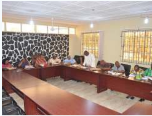
Members of Council in session at the newly commissioned building