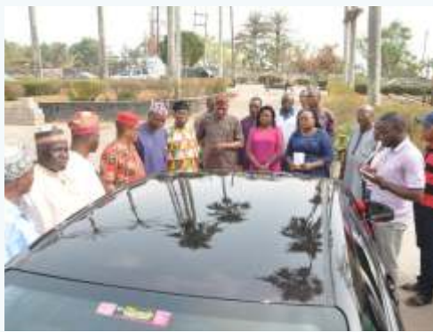
Members of Council and Staff of the Directorate of Information and Public Relations during the inauguration of official vehicles newly purchased by the college