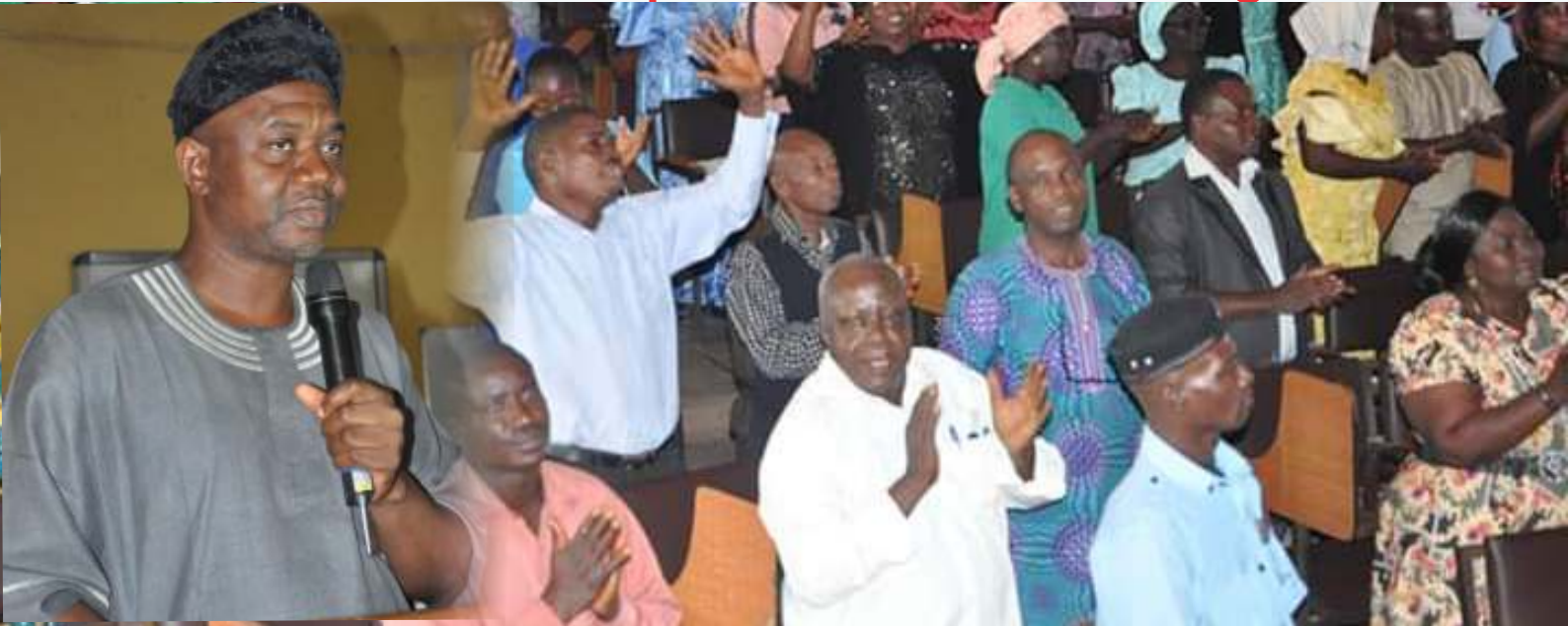
A cross section College community praising God during the March 2020 Monthly Prayer Meeting before the COVID-19 lockdown

Workers in Adeyemi College of Education, Ondo have been advised to freely relate with principal officers of the institution for its development, progress and smooth running because they are readily available and accessible.