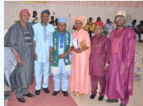
The Provost with one of the awardee and members of the executive of CYIAP network.