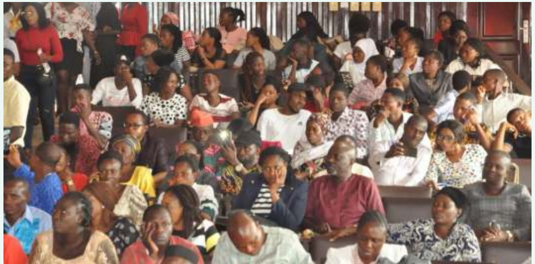
Cross section of A.C.E students and staff during the 2019 School of Arts and Social Sciences Conference